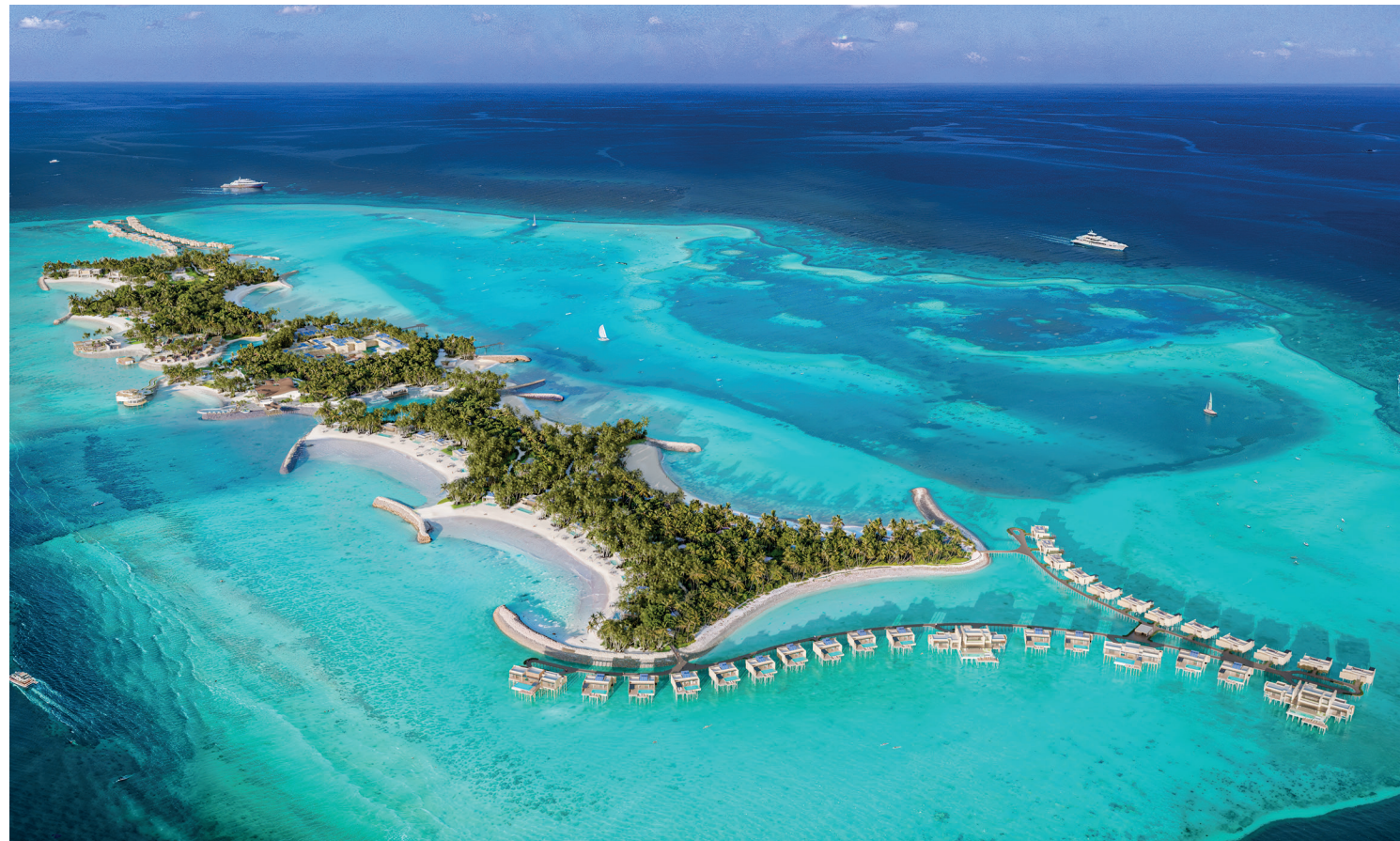
Mandarin Oriental, Maldives

The Delmore in Miami, designed in collaboration with Zaha Hadid Architects, marks its entry into the U.S. market, further expanding its international footprint. Through partnerships with world-renowned brands such as Versace Home, Roberto Cavalli, de GRISOGONO, and hospitality leaders, DAMAC consistently delivers exceptional living experiences and is known for setting new standards in design, architecture and craftsmanship.